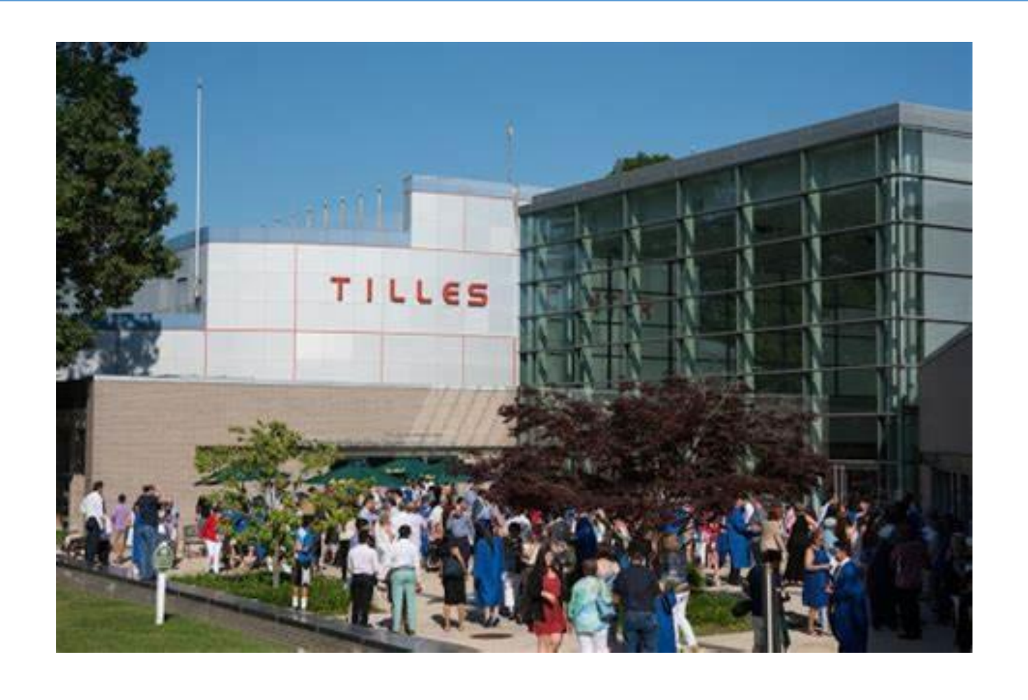
I am going to Tilles Center for the Performing Arts to see Peking Acrobats !