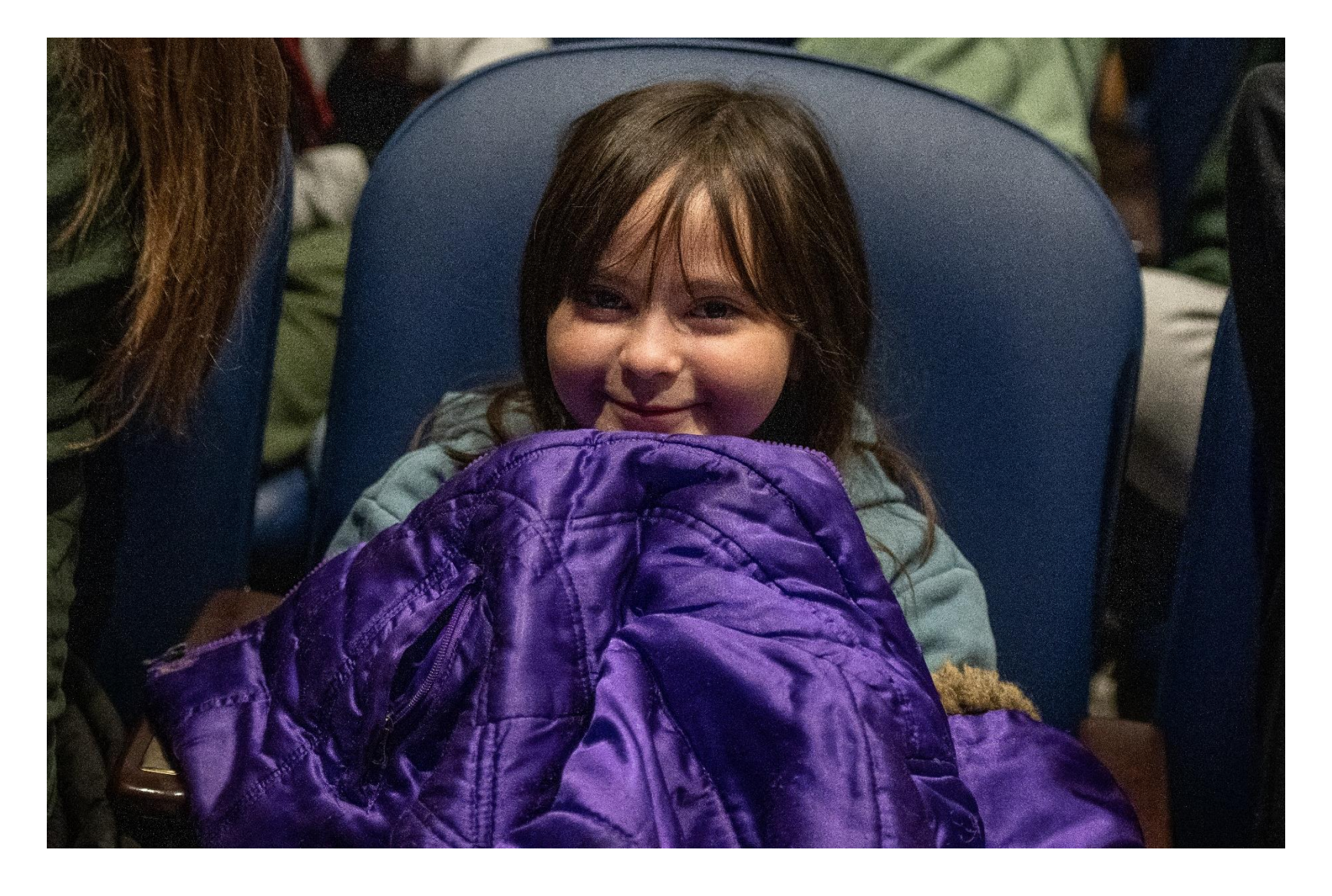
I will sit in my seat and patiently wait for the show to start.