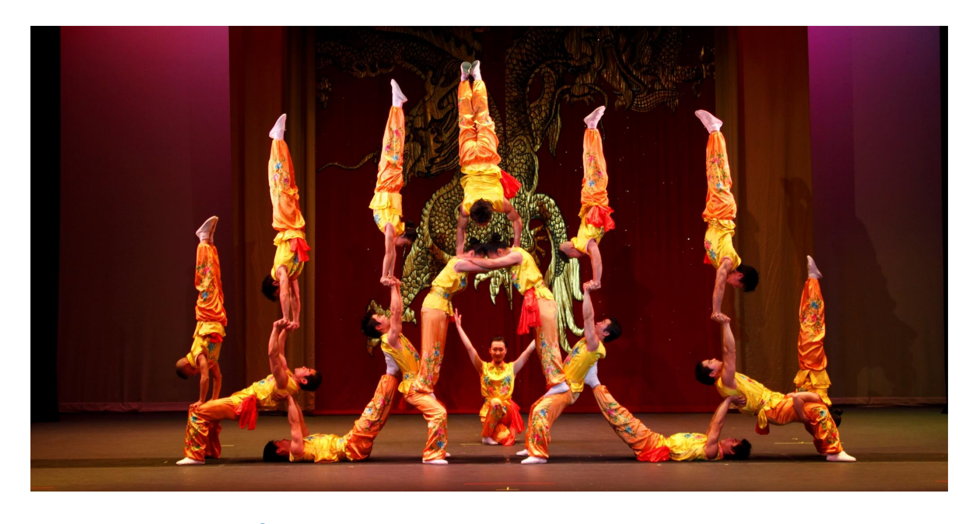
It will be fun to see Peking Acrobats at Tilles Center!