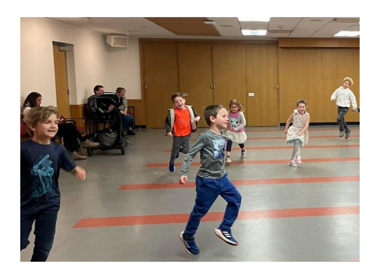
Before the show starts, I can learn martial arts.